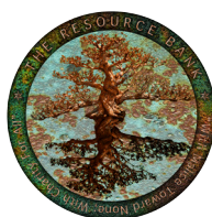
A Conservancy Affiliate